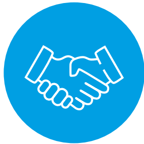
Networks & Contact