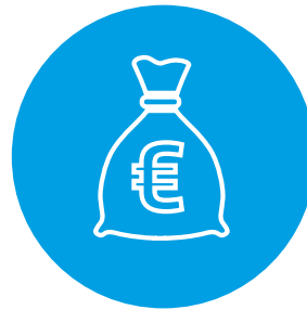
Funding & Support